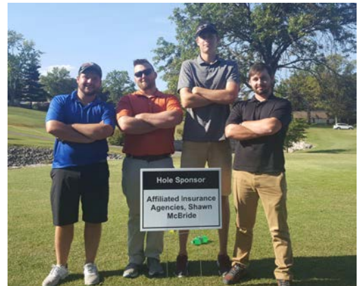
Affiliated Insurance Agencies' team in front of their hole sign