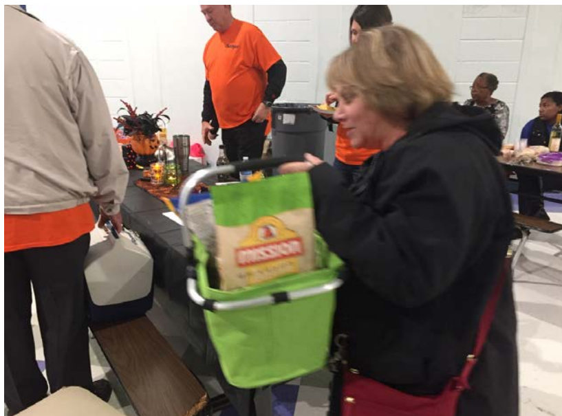
People arriving for trivia night event.