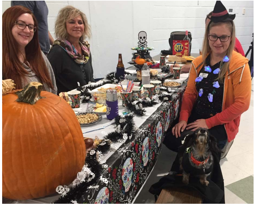
ARCH Design, Artwork & Framing won first place as best decorated table at the trivia night event.. Allie, the team's mascot enjoyed the evening as well as her human companions.

The team from Seeger Toyota won the trivia event with a score of 81 out of 100 possible. Second place went to Roberg Tax Solutions with a total score of 76. The competition was fierce between the two groups up to the last round. Congratulations to both teams!