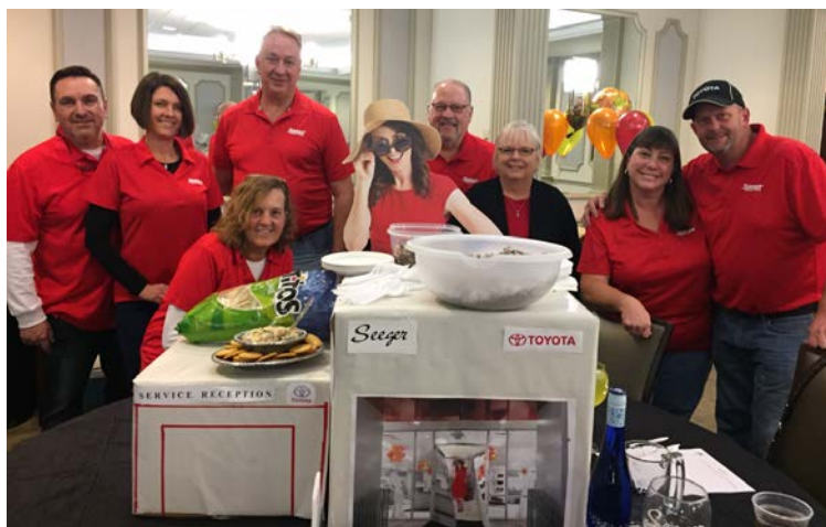
The Best Decorated Table prize was awarded to Seeger Toyota. A replica of the dealership was made out of boxes and included opening doors into the showroom floor and the service department.