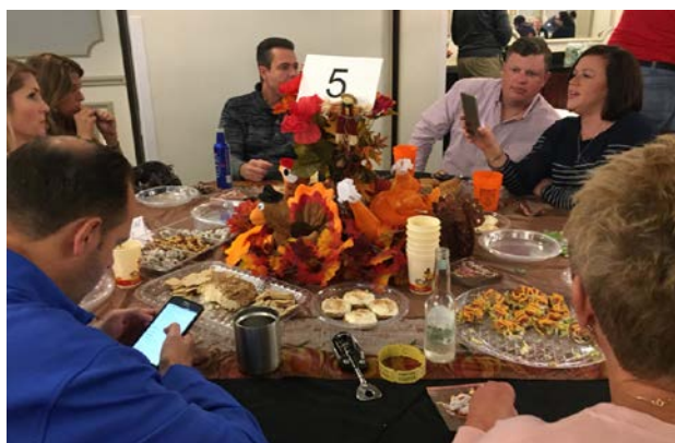
Runner up for best decorated table - RAI Insurance Group