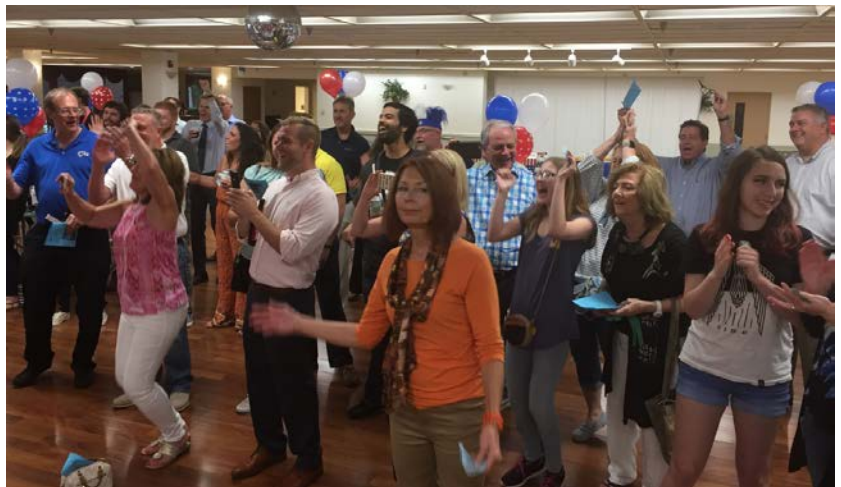
People reacting excitedly after their mouse won a race.