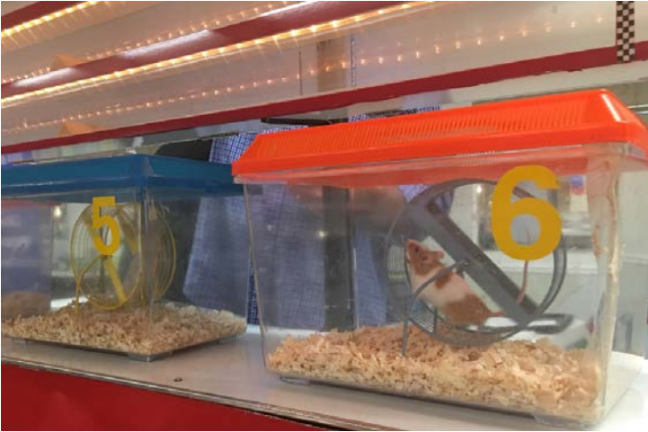
Mice warming up for their upcoming races.