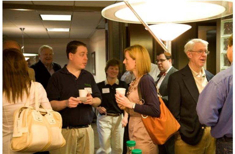
Guests mingling at the Coffee Connection.