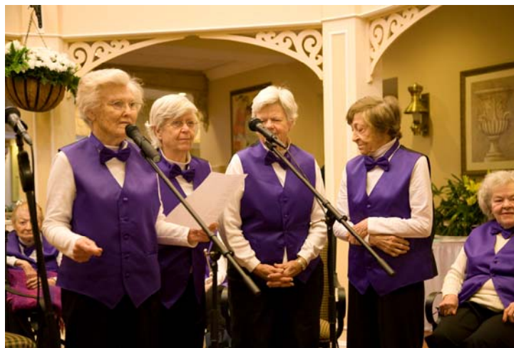
A ladies quintet from Parc Provence entertained at the breakfast.